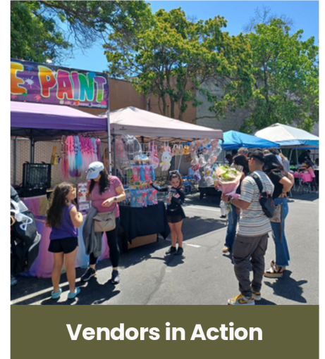
Vendors in Action